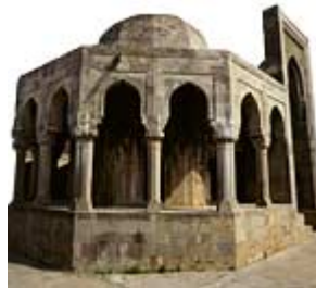
Divan Khana – heart of the Shirvan Shah's Palace