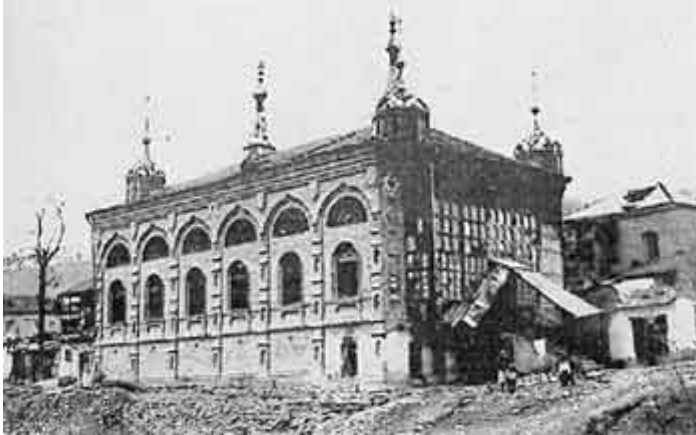
The synagogue in Krasnaya Sloboda, turned into a textile factory in 1959

There are three main Jewish communities on the territory of the present-day Azerbaijan: Mountain Jews, Ashkenazi Jews and Georgian Jews. There are also rapidly diminishing communities of Ger and Subbotnik Jews in the village Privolnoe near Iran border. The biggest and most ancient is the community of Mountain Jews, which have lived in Azerbaijan for many centuries. They are known by this name because they live primarily in the foothills of the northern Caucasus Mountains, near the city of Kuba, in the Krasnaya Sloboda village. They are believed to be descendants of Jews enslaved in Babylon during the First Exile from Israel in the 6th century BC. Some sources trace their departure from Israel in ancient times and not to the Babylonian exile, but to the time of the Assyrians. Mountain Jews are often considered to be remnants of the Ten Lost Tribes of Israel. According to local records, 972 families of Mountain Jews lived in Sloboda at the end of the nineteenth century, running eleven synagogues and twenty Jewish schools. Only one synagogue is still active today.