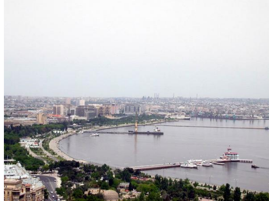
General view of Baku Bay from the highest point during the Oil Boom in late 19th century (left) and 100 years later

The architectural styles and methods used in the construction in the 19 th century were very diverse, sometimes depending not on the skills of architects, but on the customer's taste. Buildings in "new-renaissance", "new-gothic", "new-baroque", "classicism", "ampere", "modern" styles appeared in Baku. There were also buildings in the pseudo-oriental, the so-called "Moorish" style. Sometimes two or more architectural styles were mixed in one building due to the customer's requests.