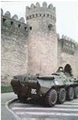
Near Shemakhi Gate of the Old City, 1990

The situation deteriorated over time and in January 1990 became even worse. In Baku a mob entered Armenian apartments, threw furniture and belongings from windows and balconies to the streets and set fires. I saw several such fires in a few blocks from our apartment. The government had lost control of the situation and local militia (police) did not intervene which led to a massacre. It was only when most of the Armenian population fled the city and some less fortunate ones were killed that the government declared a state of emergency and Russian troops were brought in to defend Armenians and restore order. By then no Armenians were to be found in the city, except those few in hiding. Rather, the Soviet government sent the troops to punish the city. On January 20 around midnight troops violently entered Baku from several directions. 122 people were reportedly killed during their assault. Five of them were Jews or of Jewish descent, out of which I remember three names.