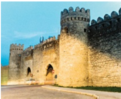
Shemakhi Gate of the Old City

The Old City remains in the center of Baku, called by local people Icheri Sheher (Inner City). The fortress surrounding the Old City became the first location in Azerbaijan to be classified as a world cultural site by UNESCO (2000). Most of the original walls and towers remain intact. The Old City is picturesque, with its maze of narrow cobbled streets, minarets, medieval palaces, and ancient buildings.