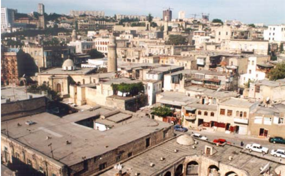
The Old City. Flat roofs covered with tar are typical for Baku

At the beginning of 19 th century, at the time of its conquest by Russia, Baku was limited to the enwalled Old City with only about 300 houses and 3,000 inhabitants on the 21.5 hectares (ha) of territory. Only after the termination of the Russo-Persian War of 1826-1828 the city began to grow. By 1874 its population was 15,000, in 1897 – 112,000, in 1918 – 248,300 (on 1,300 ha of territory), in 1952 – 982,000 and in 1982 – 1,618,000. In 2005, Baku has an estimated population of 2,036,000 people.