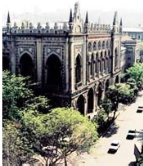
These two buildings were built during the oil boom period (1880-1920): Baku City Hall, 1904 (left) and Academy Of Science, 1913 (right)

This was a period of rapid development, with new residential districts, gardens and park systems, transport and city communications, oil producing and refining industrial districts all established at the time. This created unique architecture of Baku, which has still not lost its beauty.